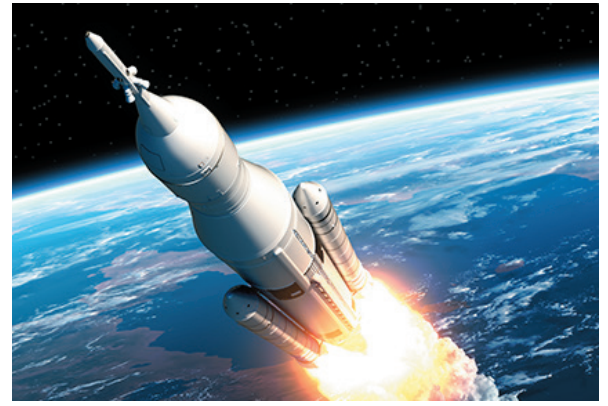
As launching satellites costs thousands to tens of thousands of dollars per kilogram, reducing the weight of a satellite system can directly influence the cost-per-bit of high-speed satellite communication services.

(bias current and bias voltage) is as efficient as possible. MMICs designed in this way also derive the benefit of lower power draw. They are also typically smaller, demonstrate better temperature performance, and provide improved SNR at lower power levels.